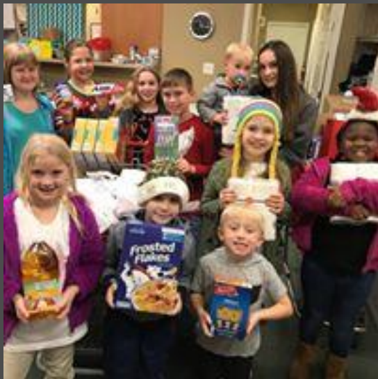
Thankful for the giving hearts of the kids at Blue Springs Baptist Church. They raised money to buy food and hygiene items for our pantry.