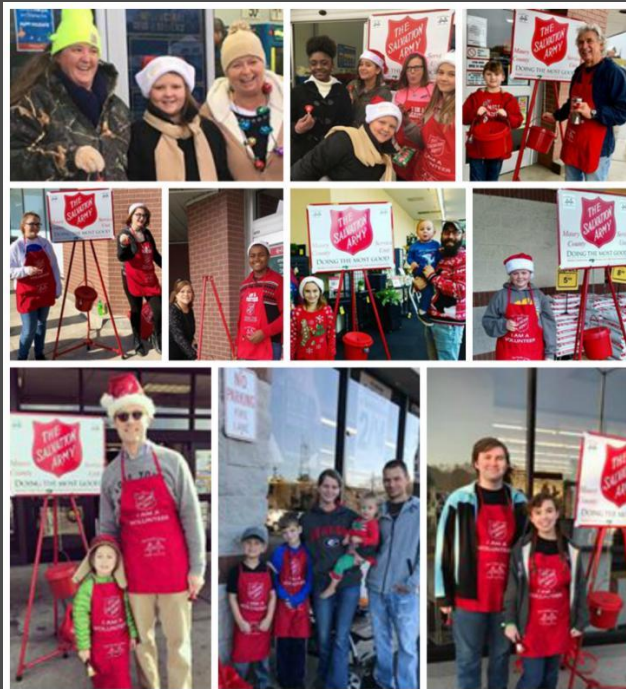
These are just a few of the young bell ringers that helped us this year. THANK YOU!