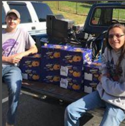
Columbia Central Band donates fresh fruit for us to give out to our clients in December.