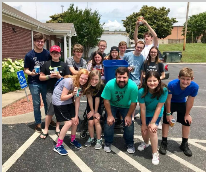
Highland Church of Christ Youth Group collected canned goods for our food pantry.