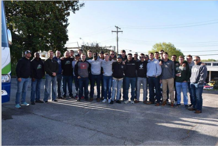
Columbia State Baseball Team helped us at our food giveaway.