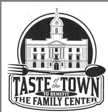
Taste of the Town November 1st

We will be sending out more information on these events as they get closer. For now, please mark your calendar.