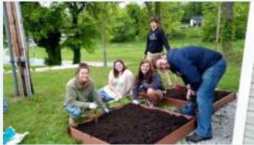
Youth Group from First Presbyterian were preparing the garden beds for planting.