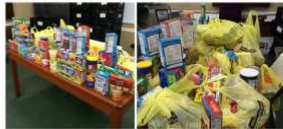
Youth from St. Luke's Methodist Church collected kid friendly foods for our pantry.