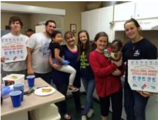
Youth from Pleasant Heights Baptist Church provided and served lunch at our May Lunch & Learn.