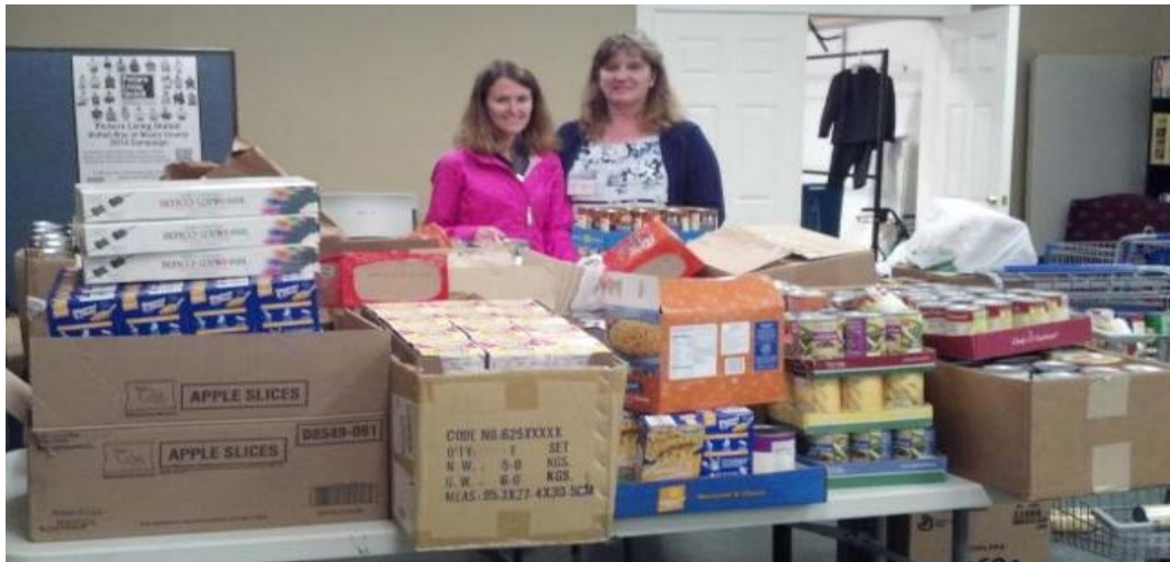
Joseph Brown Elementary School Annual Canned Food Drive