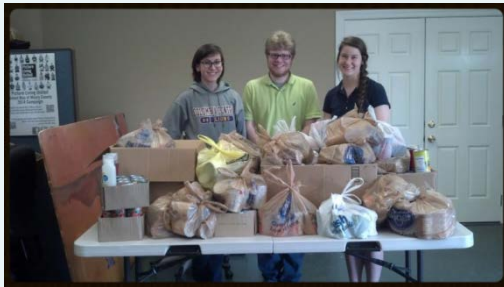
Members of Central High School Key Club