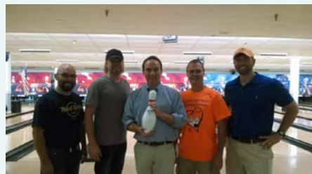
First Presbyterian Church Winners of the 2014 Church Division

Not a bowler? Don't worry, there are lots of ways you can participate and not bowl! Stay tune for more information!