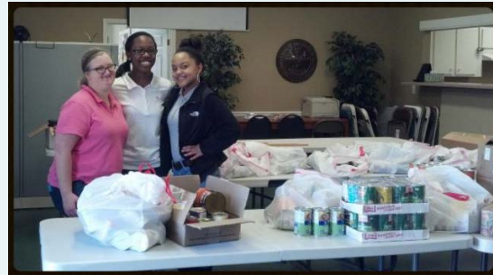
Members of Central High School Key Club

We want to say a special thank you to Columbia Central High School Key Club and their wonderful giving spirit. They held a canned food competition in the homerooms to help feed the hungry in our community!