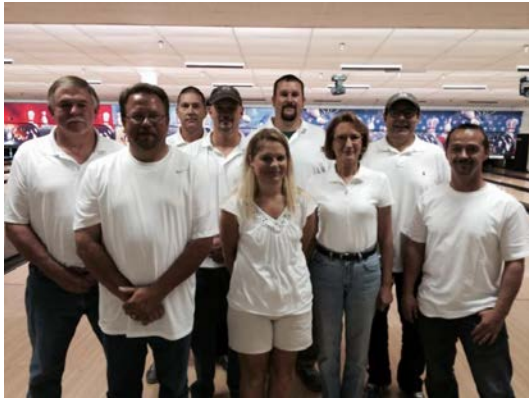
2014 BMC Metalworks Team

Our 2014 Bowling Tournament was a great success! A big thank you to all the teams