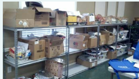
2013 Thanksgiving boxes.

Thanksgiving is fast approaching! Many of the families we serve will not have the means to provide a Thanksgiving meal. Adopt a Thanksgiving Box and provide a Thanksgiving meal for a family in Maury County they can cook themselves. Our goal is to provide 75 boxes to our families. Call 388-3840 to participate!