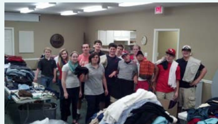
Columbia Academy Students sorting clothes

We want to say a special thank you to Columbia Academy Students! Almost every week, a student or group of students visits The Family Center to help with gardening, sorting clothes or straightening up the pantry. We love it when the young give their time and talents to help others!