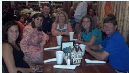
2013 Dine Around at Puckett's Grocery